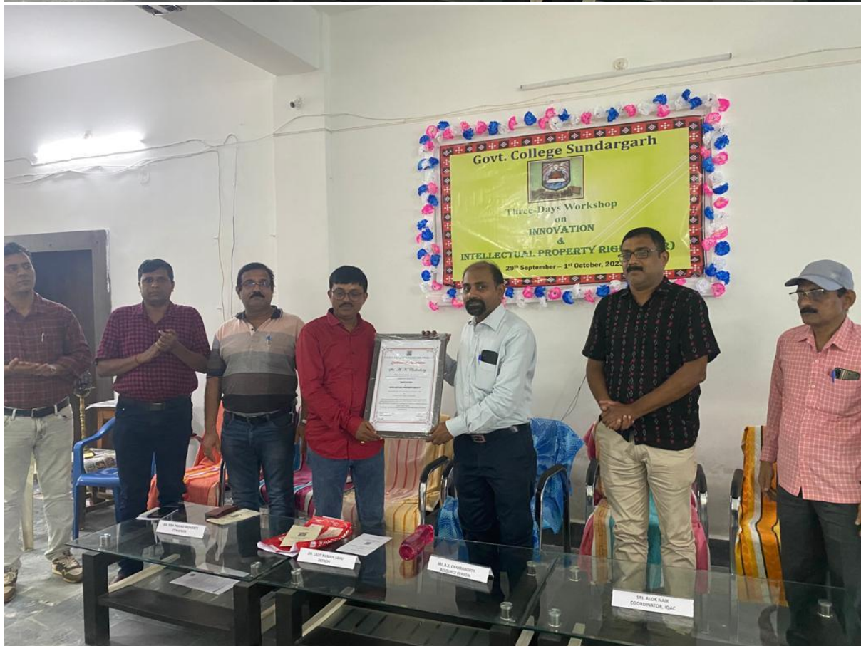
(Felicitation to Resource Person)