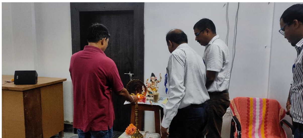
(Lightening of Lamp)