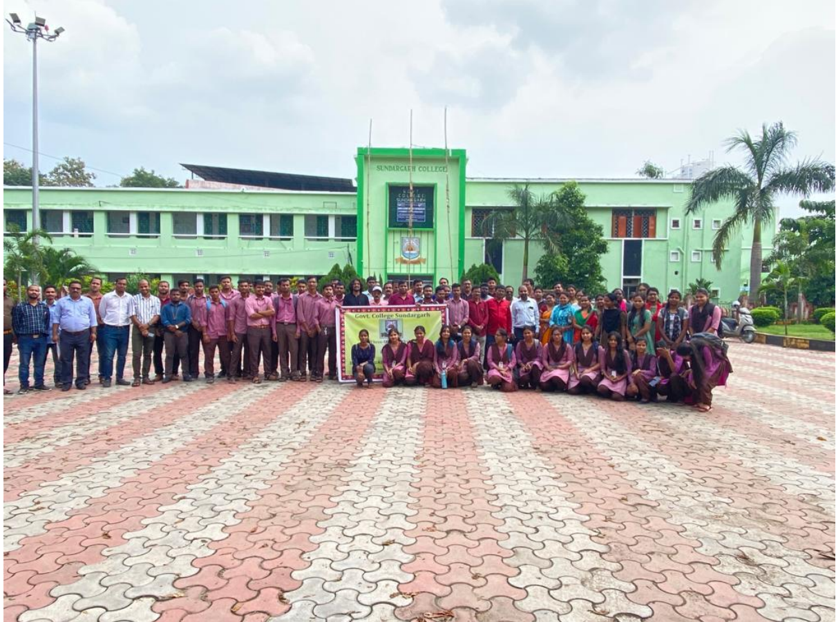
(Group Photographs after completion of the workshop)