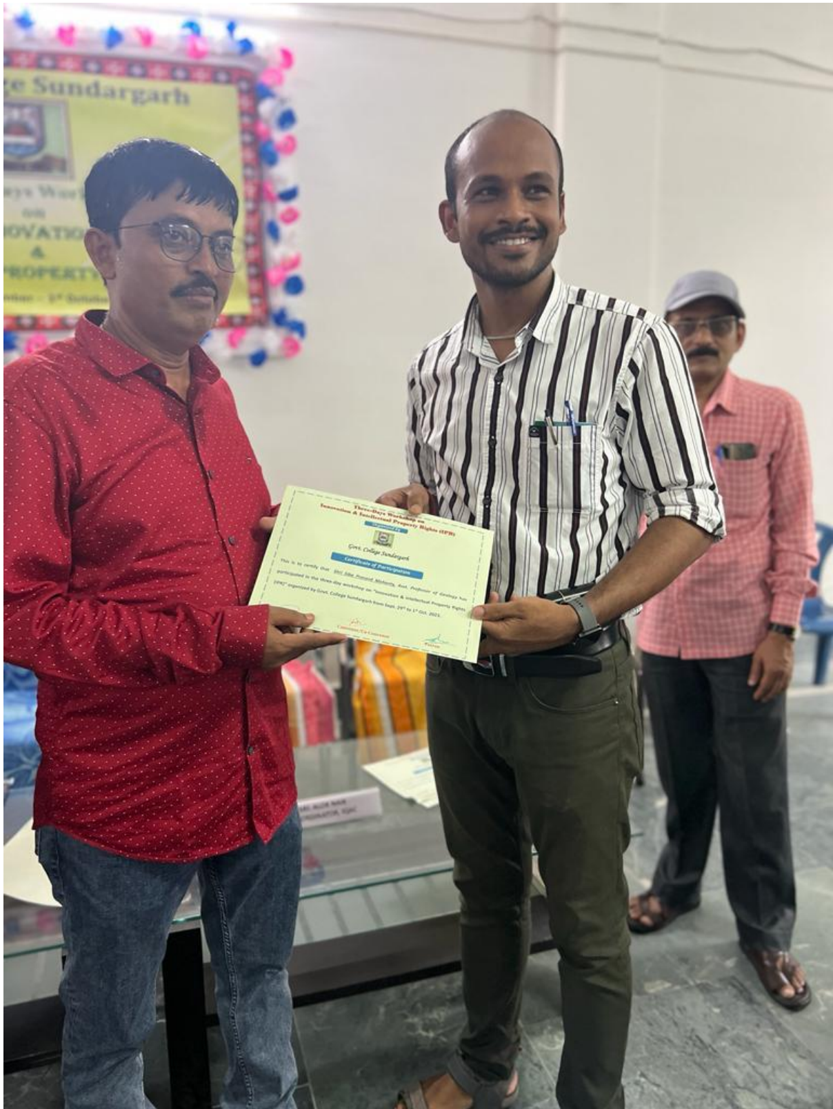
(Certificate distribution during the Session)