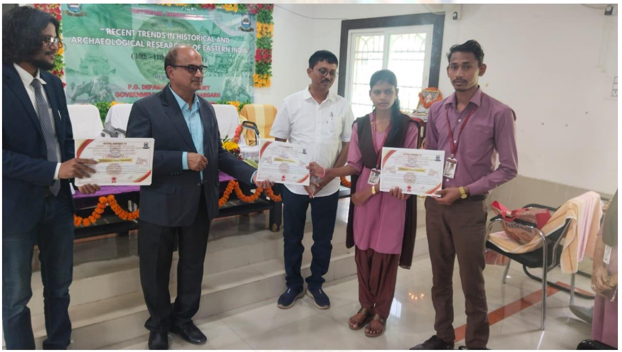
Certificate Distribution to P.G. students.